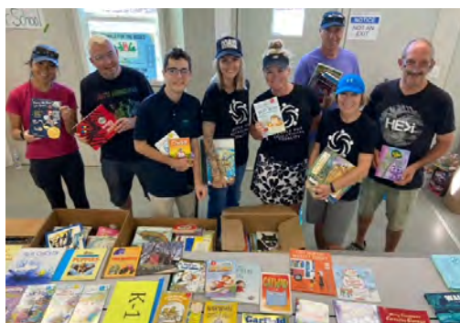
Volunteers the "Books, Burgers, and a Blessing" event at Kamehameha III School's temporary campus.